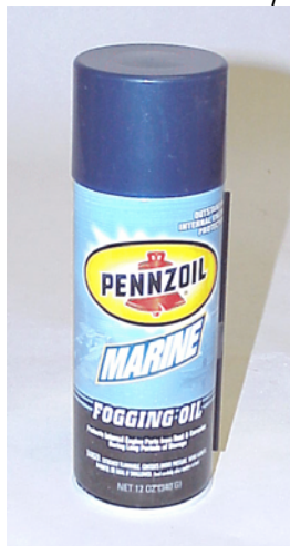
Figure #1- Pennzoil Fogging Oil #1109 provides a fine film on engine parts that prevents rust and corrosion during storage. CPS Part #9645

Long Term Storage: Storing an engine pass one month requires certain precautions. Prior to shutdown run the engine at about 3000 rpm. Remove the air cleaner and spray a fogging oil ( 5-10 seconds) into the Carb. Engine may stop during this process. Stop engine and remove spark plugs and inject the same fogging oil into the combustion chamber (10 second spray per chamber. Turn the crank over 2 or 3 revolutions coating all top end parts. Replace spark plugs. Drain float bowl, fuel lines, and fuel tank. Drain coolant to prevent damage from freezing. Close all openings of the engine like exhaust end pipe, venting tube, and air intake to prevent entry of dirt and humidity. Remember, in storage the oil will evaporate. What is left behind is a sticky residue that does little to prevent rust while making start up more difficult next spring. The fogging oil referred to is a hydrocarbon solvent that provided a fine film on all internal parts. See Figure #1.