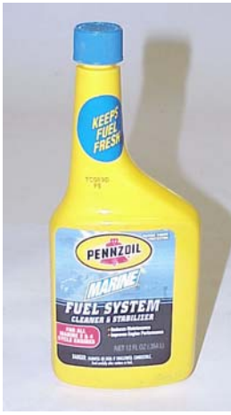
Figure #2 – A Fuel System Cleaner and Stabilizer helps prevent gum and varnish in tank, lines, and float bowl. CPS Part #9647